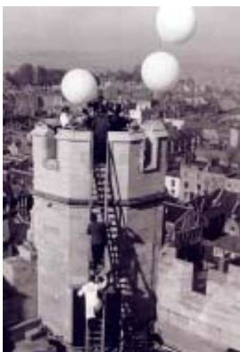
Cecil Powell's cosmic rays research team launching a balloon from the Royal Fort, Bristol University, probably 1940s. Powell was awarded the Nobel Prize for Physics for his cosmic rays research and balloons were at the heart of this work.