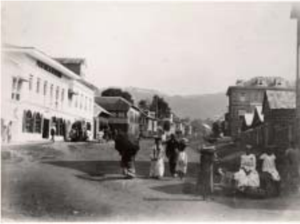
Hawe Street, Freetown, Sierra Leone in 1905, taken as one of the UAC companies, Pickering and Berthoud appears on the left.