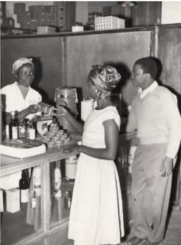
Inside a branch of Kingsway Stores (a UAC business) in Kano, Nigeria, undated, but c1961.