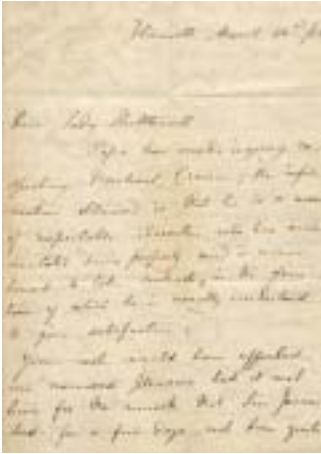
Autograph letter signed by Charlotte Brontë to Lady Kay-Shuttleworth, at Haworth, which speaks of, amongst other things, the effects of a solitary life on a person's character, 1850. Accepted in lieu of Inheritance Tax, 1999.