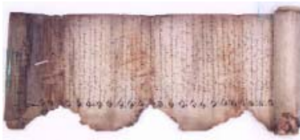
Church Commission Durham Bishopric Estates Deposit: parchment roll B/7/71.

Grants range from £1,000 to £30,000 and the Trust encourages successful applicants to use NMCT grants as part of their matching funding for bids to other funding bodies like the Heritage Lottery Fund.