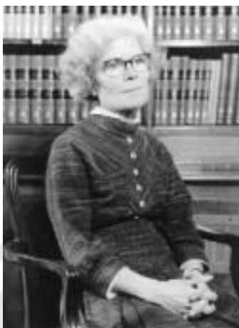
Kathleen Lonsdale who was one of the first two women scientists to be elected to the Fellowship of the Royal Society in 1945.