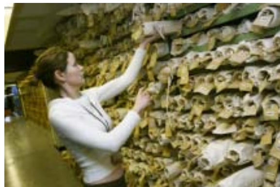
Behind the scenes at the National Archives, by Jonathan Goldberg, copyright Resource.

The vision is based on a step change in the purpose and nature of archives, combining the traditional role of preservation and access with new ideas of public access, and ways of working. To test the 'step change' proposed by the Task Force, Resource is busy listening to the view of all those with an interest in archives through a series of consultation meetings. Contact: Emma Halsall, Resource on 020 7273 1421 or email emma.halsall@resource.gov.uk